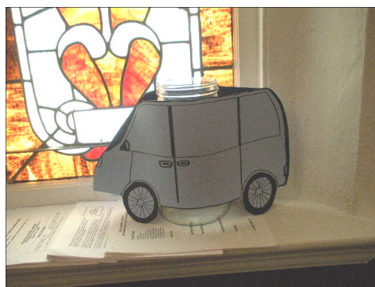
(Right) Collection for van for Alaskan Missionary work.